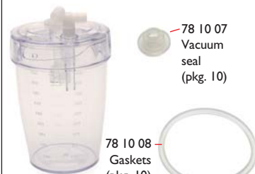
78 10 07 Vacuum seal (pkg. 10)