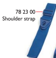
78 23 00 Shoulder strap