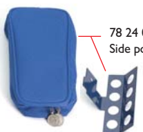
78 24 00 Side pouch