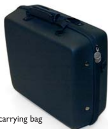
78 20 10 Semirigid carrying bag