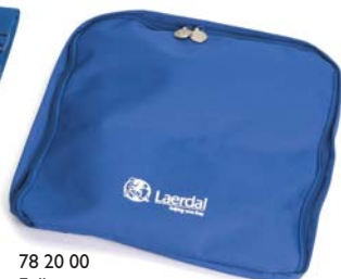
78 20 00 Full covering carrying bag