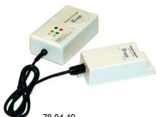
78 04 40 External charger kit