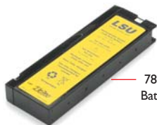
78 04 00 Battery